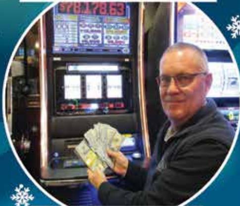
Noral of North Dakota Bonus Times