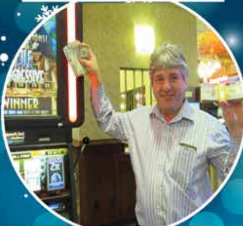
Lyle of Wyoming King Kong